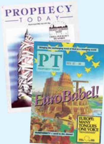
Covers of the original Prophecy Today magazine, in print 1985-2006

These four pages contain excerpts from the contemporary ministry of Prophecy Today UK, which includes commentary on public affairs, teaching articles and book reviews.