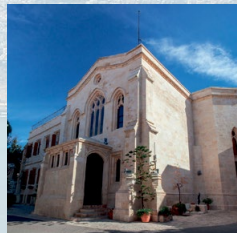
Visit Christ Church, Jerusalem

There will be a spiritual element to our tour as we explore the Biblical sites where God made covenants with His people. Visit the Galilee, Bethel, Shechem, Shiloh, Hebron, Beersheba and Jerusalem.