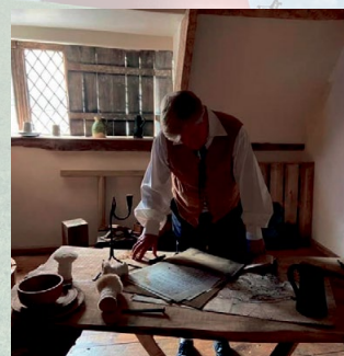
Immerse yourself in the Pilgrim experience!