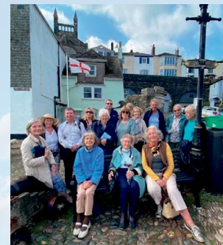
Last year's Pilgrims enjoying a stop at Plymouth