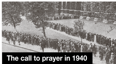
The call to prayer in 1940