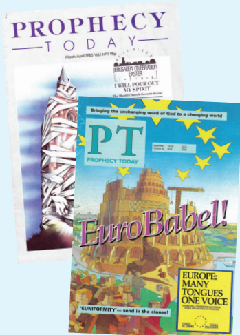
Covers of the original Prophecy Today magazine, in print 1985-2006

These four pages contain excerpts from the contemporary ministry of Prophecy Today UK, which includes commentary on public affairs, teaching articles and book reviews.