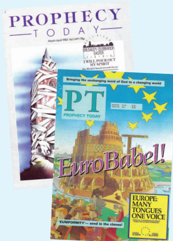
Covers of the original Prophecy Today magazine, in print 1985-2006

These four pages contain excerpts from the contemporary ministry of Prophecy Today UK, which includes commentary on public affairs, teaching articles and book reviews.