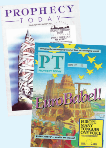
Covers of the original Prophecy Today magazine, in print 1985-2006

These four pages contain excerpts from the contemporary ministry of Prophecy Today UK, which includes commentary on public affairs, teaching articles and book reviews.