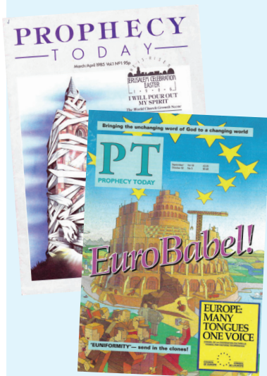
Covers of the original Prophecy Today magazine, in print 1985-2006

The next four pages contain excerpts from the contemporary ministry of Prophecy Today UK, which includes commentary on public affairs, teaching articles and book reviews.