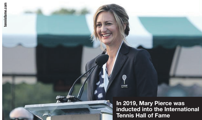
In 2019, Mary Pierce was inducted into the International Tennis Hall of Fame

Playing the French Open as a French player was always the hardest event of the year because there is so much pressure, so much expectation.