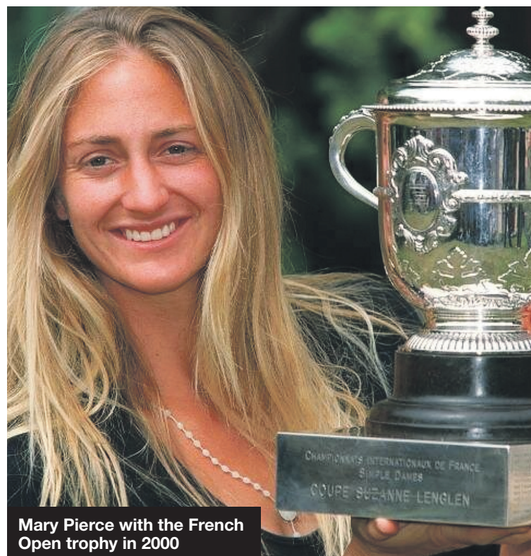
Mary Pierce with the French Open trophy in 2000