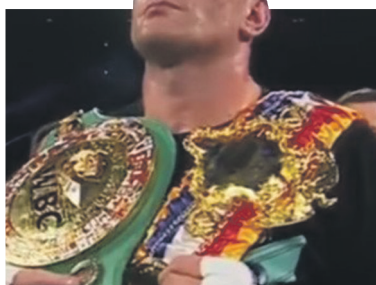
Victorious Fury just before he publicly acknowledged his God

Fury, the only man in sports history to have held all the