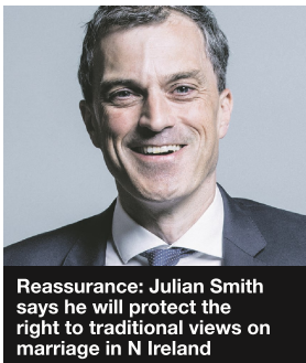
Reassurance: Julian Smith says he will protect the right to traditional views on marriage in N Ireland

According to Premier News, he said that mere criticism will not be regarded as an offence, religious groups will not be sued for refusing to support same-sex weddings and faith-based organisations will be able to sack staff who break their rules by marrying gay partners.