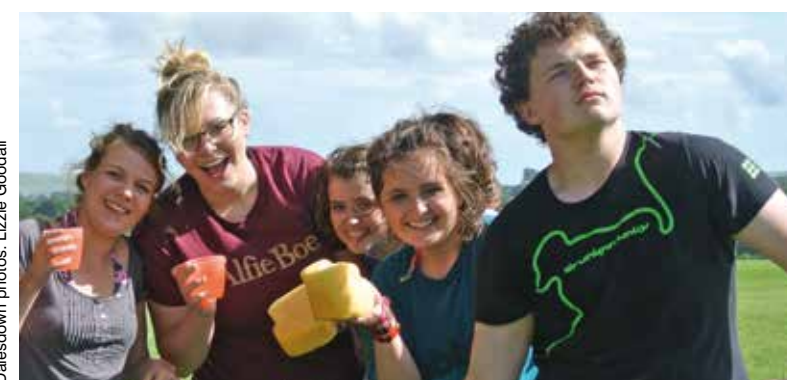
Time for teens – Dalesdown’s professional and experienced team lead activities for children and teenagers

activities. “The place is wonderful and I just feel so looked after,” said one visitor.