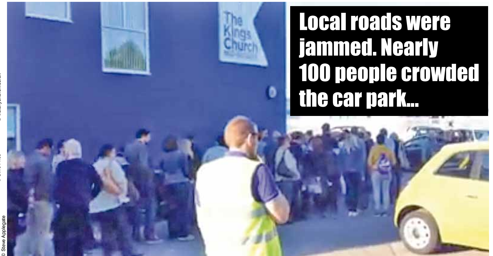
Mid-week madness? People were queuing in the car park for over an hour before the meeting started