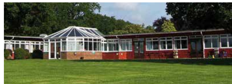
Centre peace – the main building at Dalesdown, named The Iliffe Centre in honour of its founder