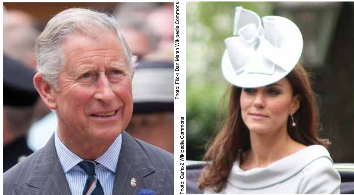
Very worried: Prince Charles can see a future challenge to the monarchy if the Duchess of Cambridge's baby grows up to marry outside the Church of England