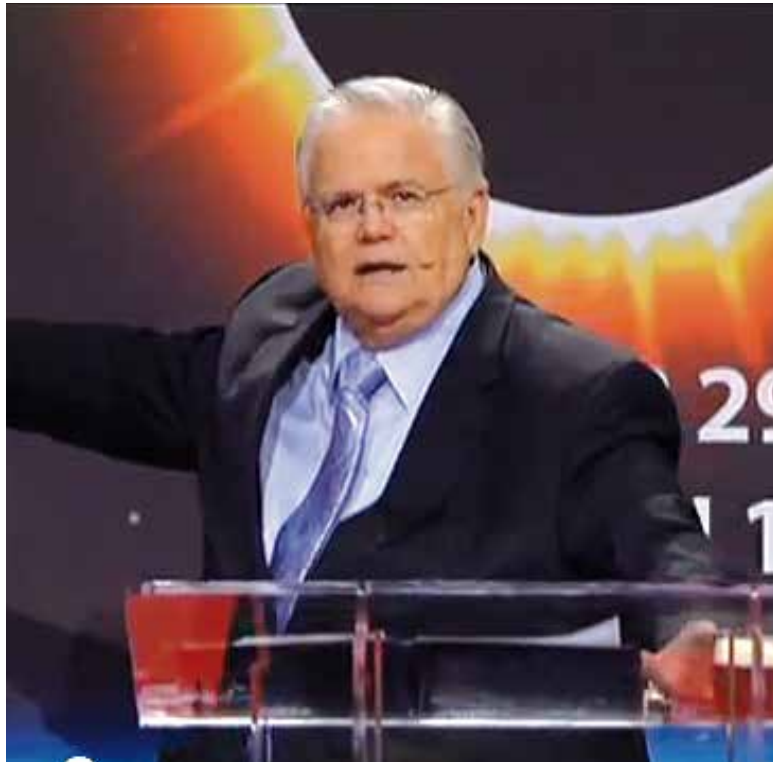
Mega-church pastor John Hagee prophesied cataclysmic events