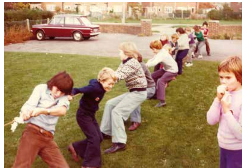
Battle lines – tug of war contest at the old Wickbourne Chapel in 1972