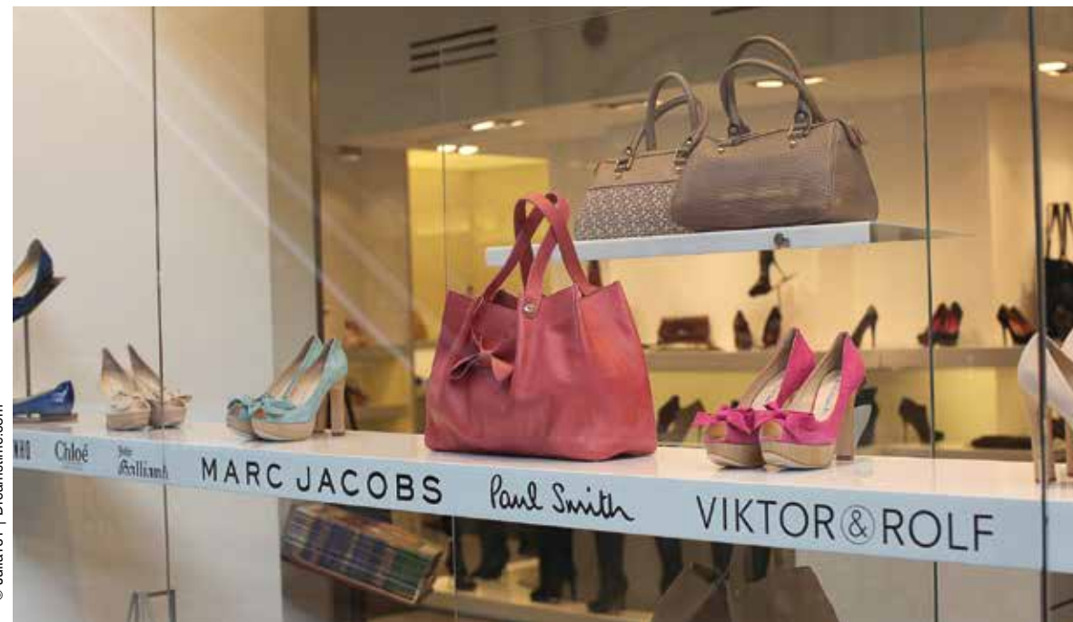
Imagine never being able to go shopping with your child. This had been the reality for this Worthing woman for five years

When she opened her eyes, she said, "My whole body's tingling." As she said she could feel no pain, the