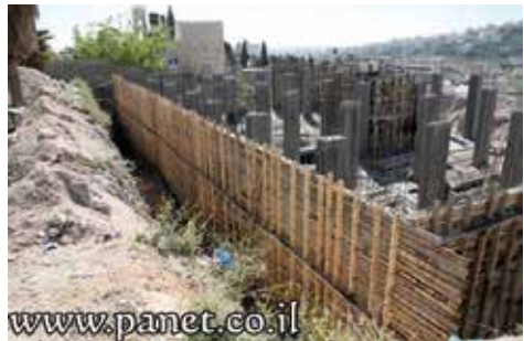
The Al Izaria Monastery with the illegal development