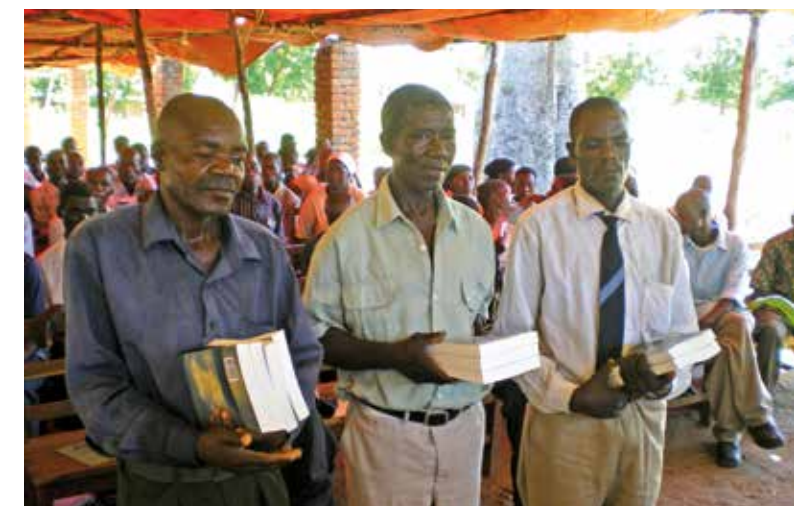
Mozambican pastors receiving Bibles