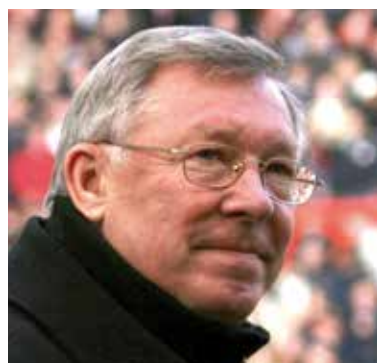
Sir Alex Ferguson