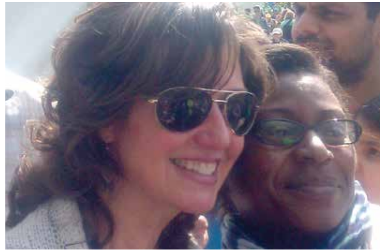
Amy Grant and friend