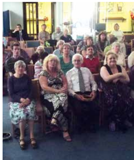
The special tenth birthday celebration